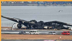
Runway incursion in aviation means an occurrence which involves incorrect presence of a person, vehicle or aircraft on a protected surface, i.e Runway

New Year brought a sad news for aviation industry on 2 nd January 2024 when a passenger A350 collided with Dash - 8 on the Runway, claiming 5 lives. Miraculously, all 379 occupants of A350 safely evacuated which is an ideal example of the discipline and awareness of passengers on board. As we cannot jump right away to conclusions, but it was quite obvious that the incident happened due to runway incursion.