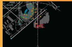
MUHAMMAD ARSLAN Air Traffic Controller-IIAP muhammad.arslan @caapakistan.org.pk

ARWIS is a very effective tool for independently and timely advising the air traffic control to take evasive action. Conclusion: Safety Systems in place need continuous improvement of procedures, identification and mitigation of safety risks, highlighting latent factors which are posing hazards and persistent awareness on safety risks is imperative to ensure that crew and air traffic control are equipped with the modern practices. Only then we can inculcate "safety culture" at our workplace.